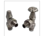
Old English Pewter