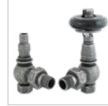
Old English Pewter