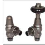
Old English Pewter