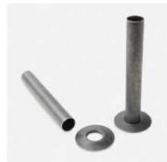
Old English Pewter