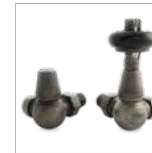
Old English Pewter