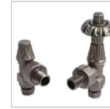
Old English Pewter