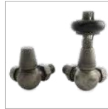
Old English Pewter