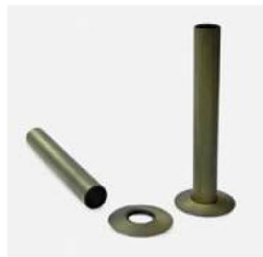
Old English Brass