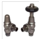
Old English Pewter

"Truly authentic and beautiful radiators, they transform a room dramatically. Excellent customer service, I would recommend Paladin to anyone."