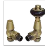
Old English Brass