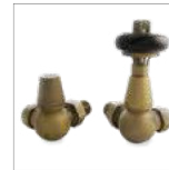
Old English Brass