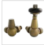
Old English Brass