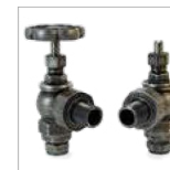
Old English Pewter