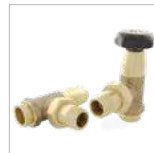
3/4" Un- Lacquered Brass