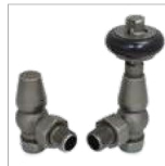
Old English Pewter