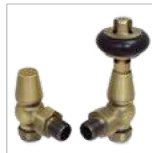
Old English Brass