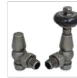
Old English Pewter