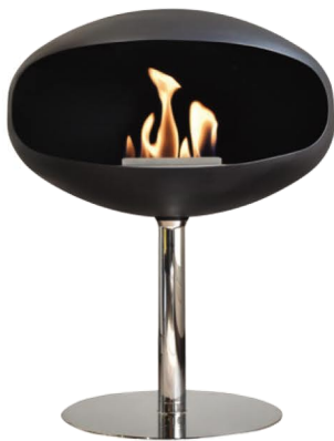
CFPB with 316 Stainless Steel Stand