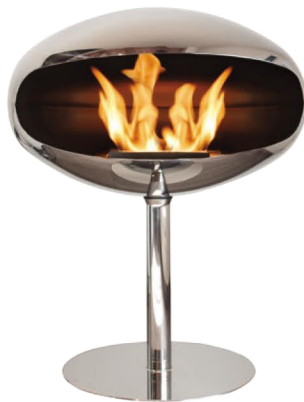
CFPSS with 316 Stainless Steel Stand