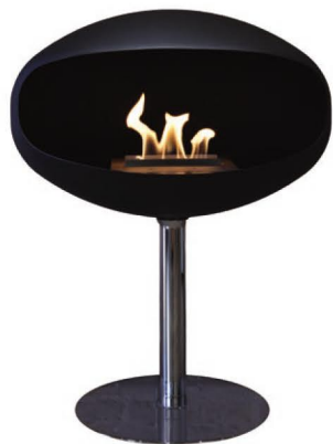
CFPBBLK with Black Stand