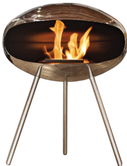
CFTSS with 316 Stainless Steel Legs