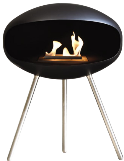
CFTB with 316 Stainless Steel Legs