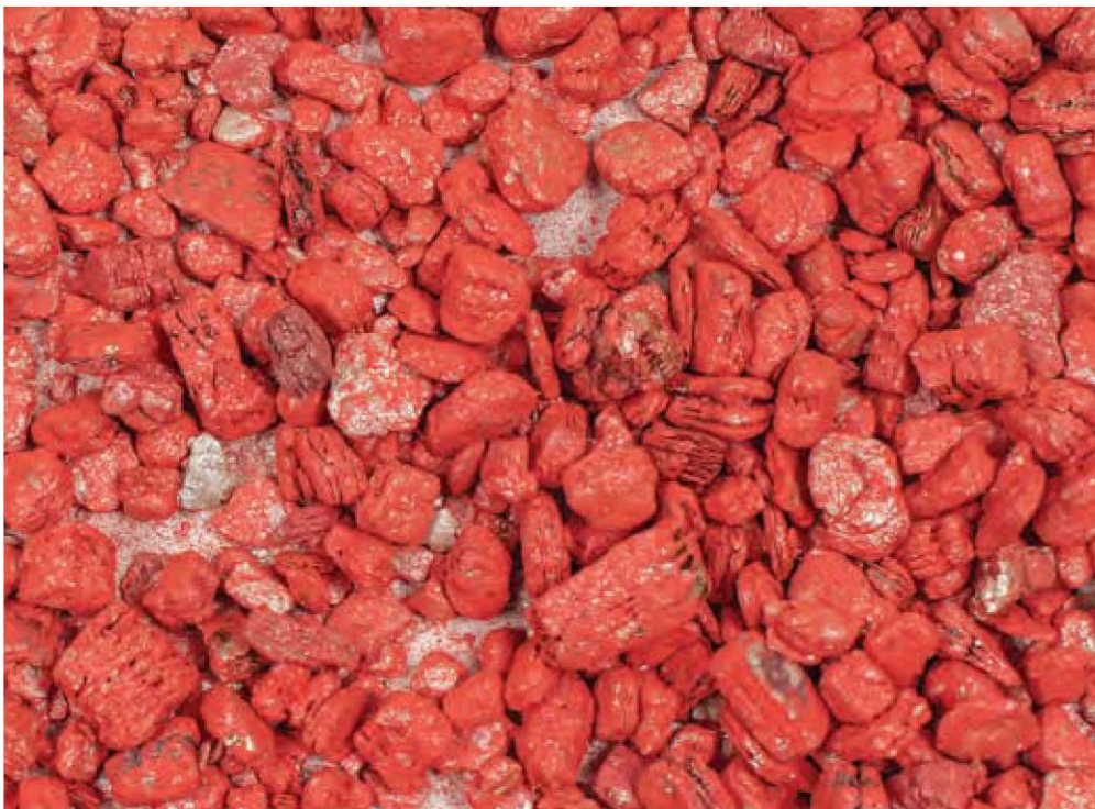
RED SEA | RSLV-020 | 4020