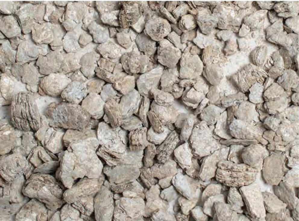
CORAL SEA | CSLV-017 | 4017