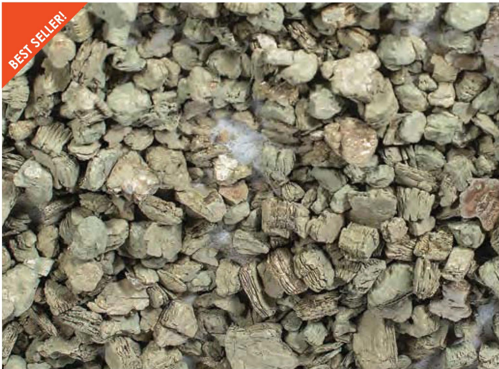
TASMAN SEA | TSLV-021 | 4021