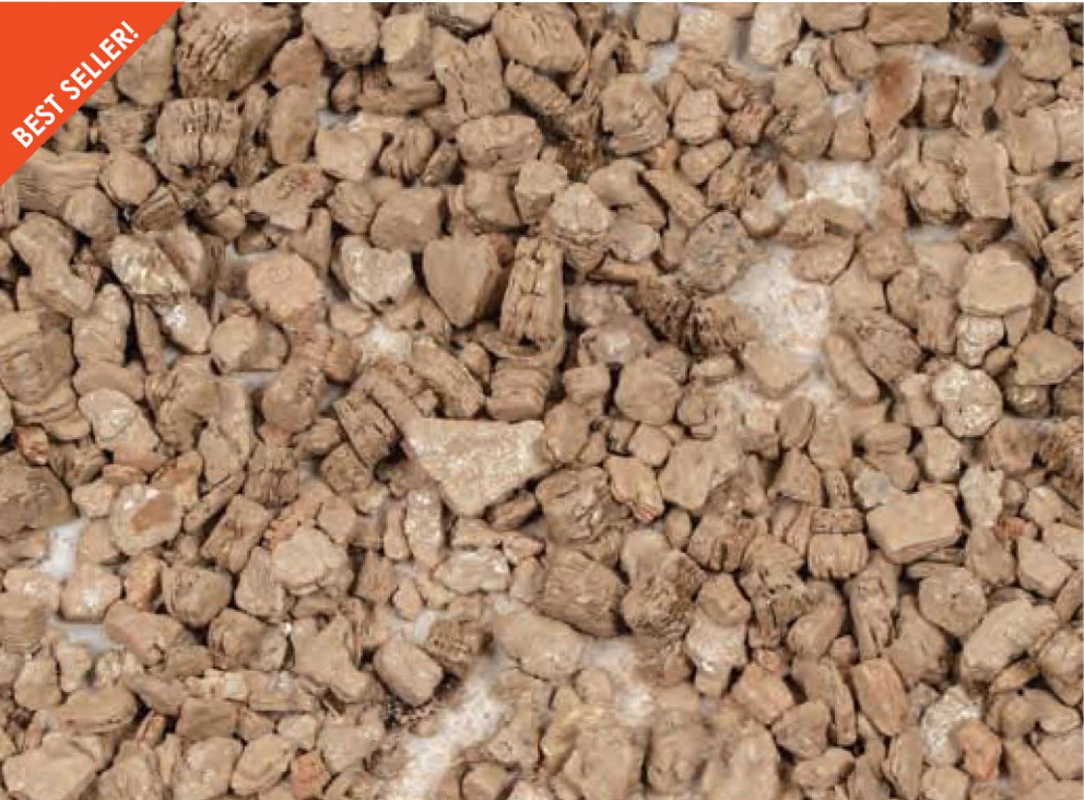
ADRIATIC SEA | ASLV-015 | 4015