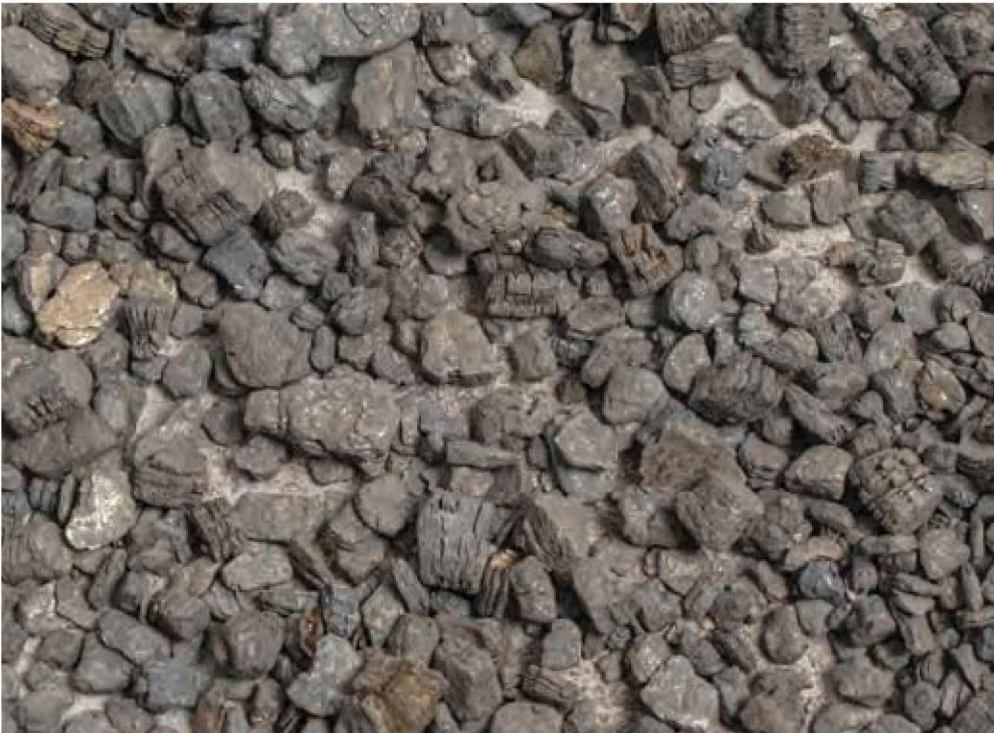
LABRADOR SEA | LSLV-018 | 4018