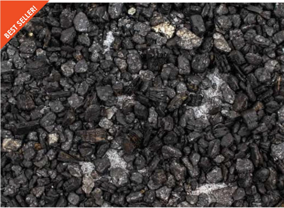
BLACK SEA | BSLV-016 | 4016