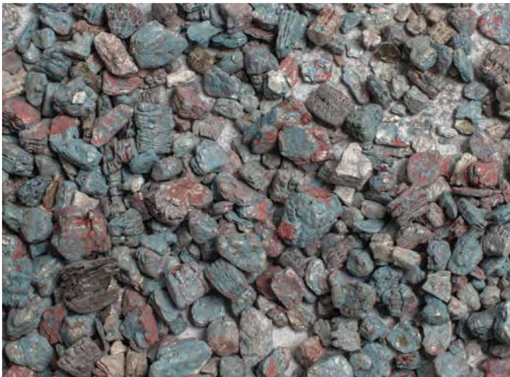
MEDITERRANEAN SEA | MSLV-019 | 4019