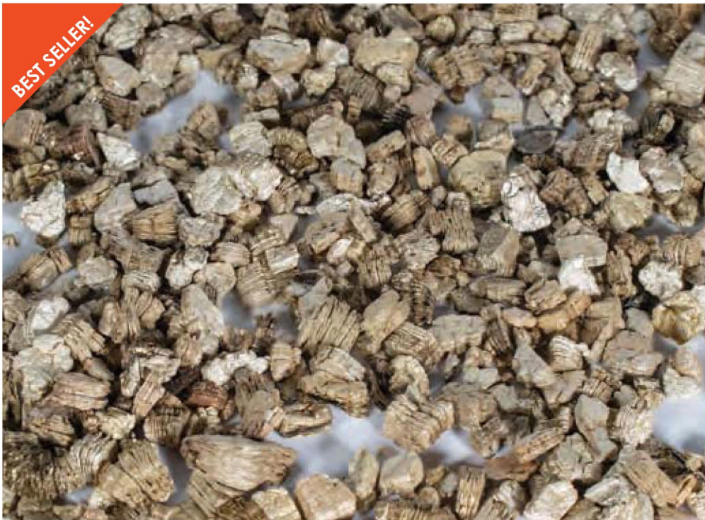
NATURAL SEA | NATV-327 | 4327