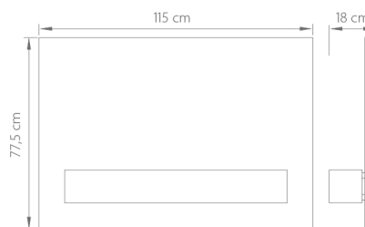
Riviera DU GL Weight: 21 kg