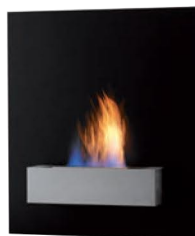
Riviera EN GL

Note: The Riviera LE GL contains a specially designed burner with a capacity of 1.7 litres, burning time 8-10 hours.