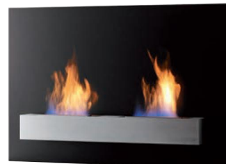
Riviera DU GL