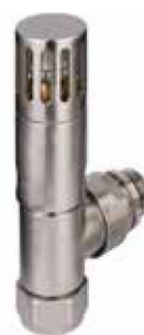
Nickel Angled Wheelhead

Please note: all valves are sold in pairs, a lockshield and a wheelhead.