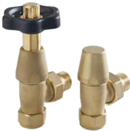
Brass Angled Wheelhead & Lockshield