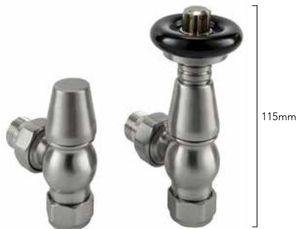
Nickel Angled Wheelhead & Lockshield (Black Top)