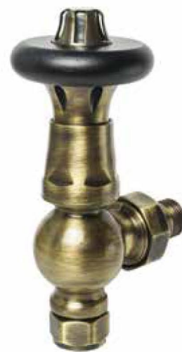
Antique Brass Wheelhead (Black Top)

Please note: all valves are sold in pairs, a lockshield and a wheelhead. Angled will be supplied as standard, please specify if you require straight valves.