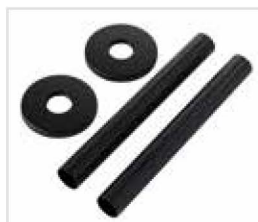
Textured Black Matt