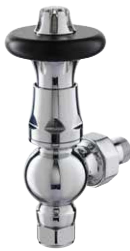
Chrome Wheelhead (Black Top)