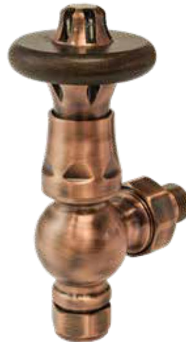
Antique Copper Wheelhead (Walnut Top)