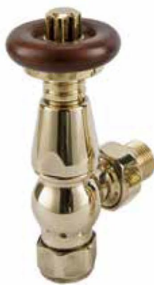
Polished Brass Wheelhead (Walnut Top)