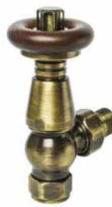
Antique Brass Wheelhead (Walnut Top)

Please note: all valves are sold in pairs, a lockshield and a wheelhead. Angled will be supplied as standard, please specify if you require straight valves.