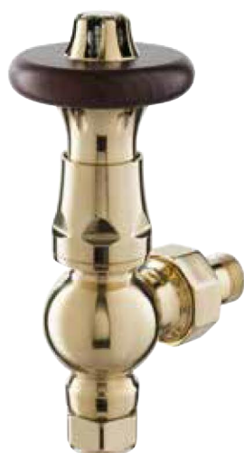
Polished Brass Wheelhead (Walnut Top)