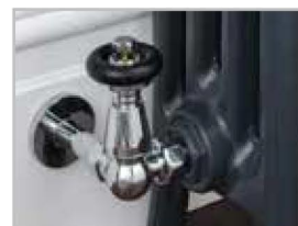
Left hand return angled valve in Chrome

Vintage TRV valves are available in a selection of handed return angled valve options. Return angled valves are left and right handed, you can select the correct option by identifying which side of the radiator has the flow connection; e.g flow connection on the left side requires a left hand wheelhead and matching lockshield.