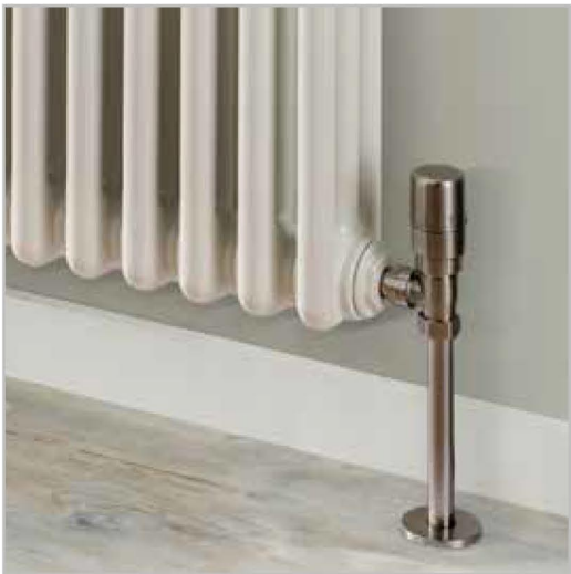
Nickel Angled Ideal TRV on Ancona®