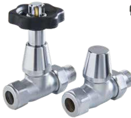
Chrome Straight Wheelhead & Lockshield