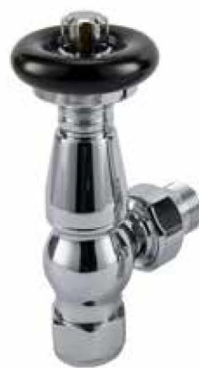
Chrome Wheelhead (Black Top)