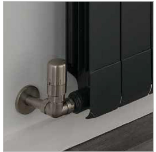
Nickel Corner Ideal TRV on the Ottimo.

Pipe Centers For angled valves allow an extra 90mm in total Valve Height 116mm Please Note Corner Ideal TRV valves are not Bi-directional