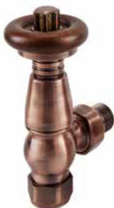
Antique Copper Wheelhead (Walnut Top)