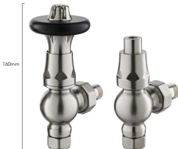
Nickel Angled Wheelhead & Lockshield (Black Top)