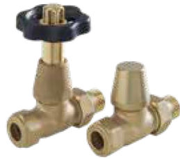
Brass Straight Wheelhead & Lockshield