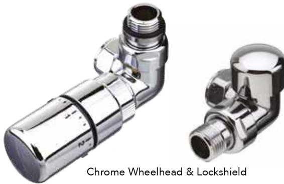
Chrome Wheelhead & Lockshield

Available in six finishes, in angled only.