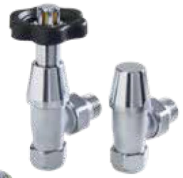
Chrome Angled Wheelhead & Lockshield

Pipe Centers For angled valves allow an extra 80mm in total Valve Height 127mm Please Note Black & Brass TRV valves are not Bi-directional