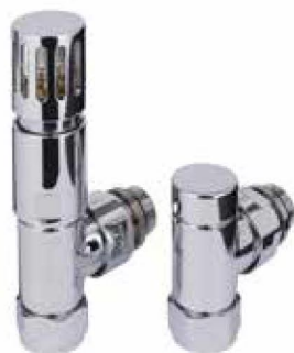
Chrome Angled Wheelhead & Lockshield (shown in the fully open position)

available in angled or straight configurations.