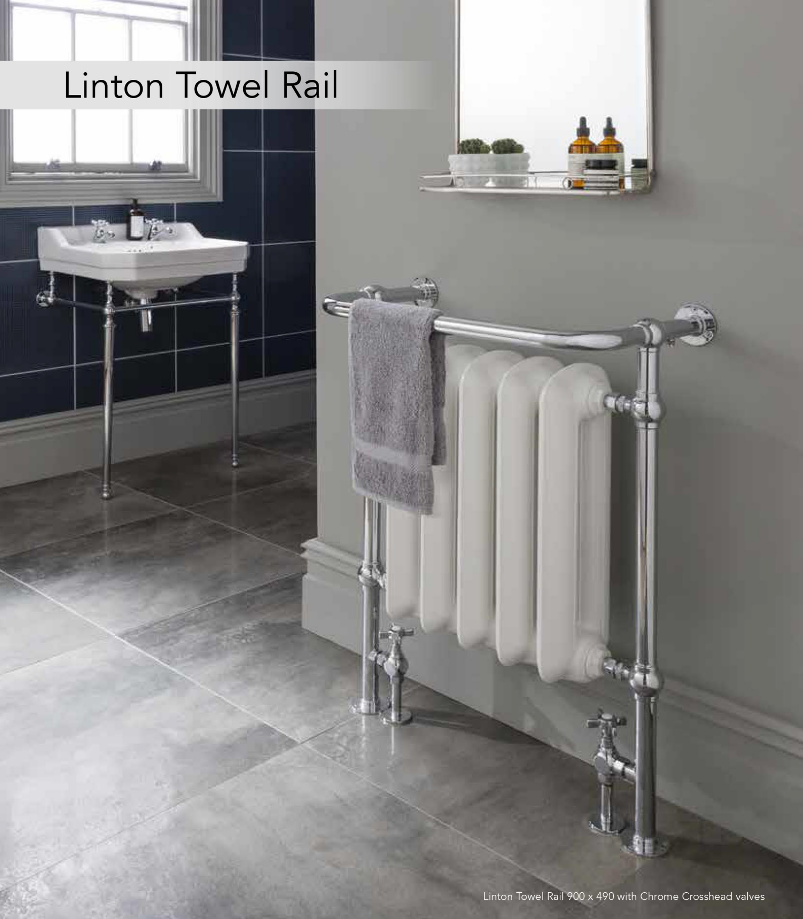
Linton Towel Rail 900 x 490 with Chrome Crosshead valves