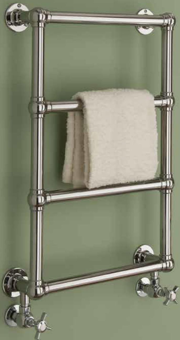
Chalfont Wall Hung 750 x 500 in Chrome with Crosshead valves