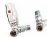
Corner Thermostatic Valve & TRV Head UAW853CT