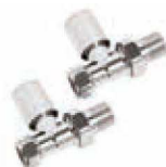
Cylindrical-30 Straight Manual Rad. Valve + L/S set CYH851C

RECOMMENDED ACCESSORIES See Page 87 For More Valves & Accessories